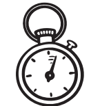
Stopwatch of Proactivity